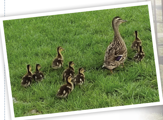
Our newest summertime residents!

Have you met our newest summertime residents? Several new families of ducks now call Our Lady of Perpetual Help home and can be seen meandering around our campus!