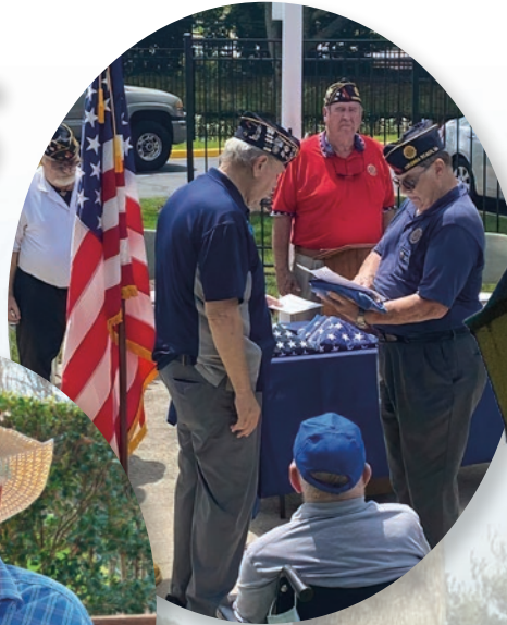
Members of American Legion Posts 110 and 113 led a Flag Day ceremony for residents.