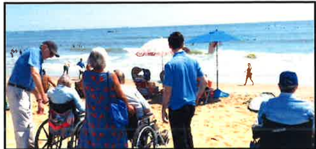
Up Close and Personal at the Oceanfront