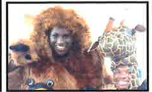
The Hurrah Players Perform Scenes from "Madagascar"