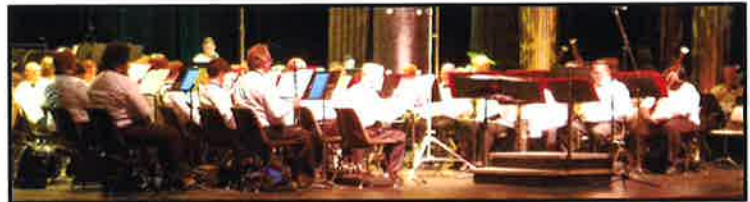
Always a resident favorite, Tidewater Winds Summer Concert