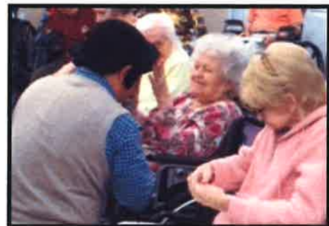
Elvis is in the House!